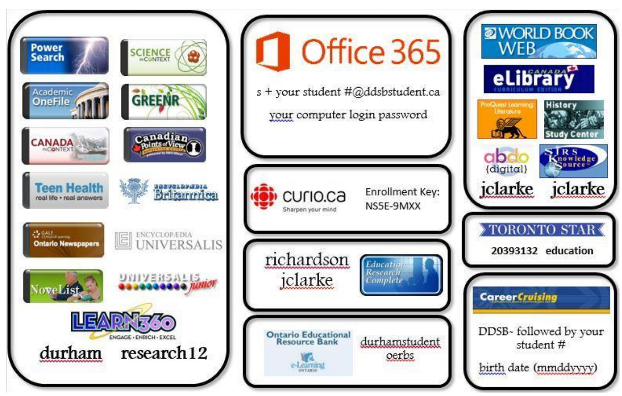
DDSB INFORMATION TECHNOLOGY POLICY